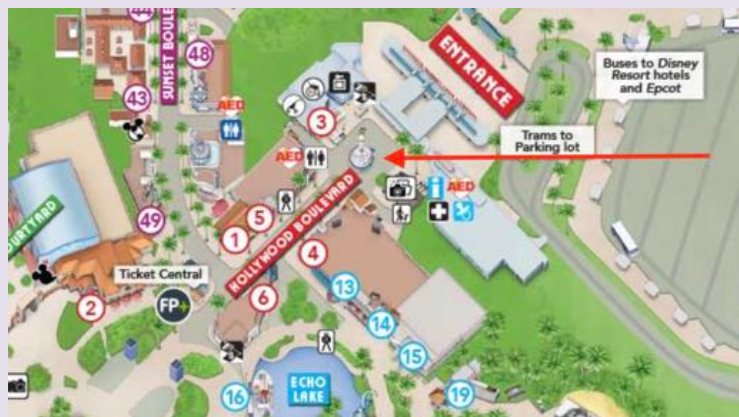
Meeting Place At 8:30 PM

We will announce a time for room checks/lights out. We will pass out the meal vouchers for the next day. You will have a choice for breakfast the next morning.